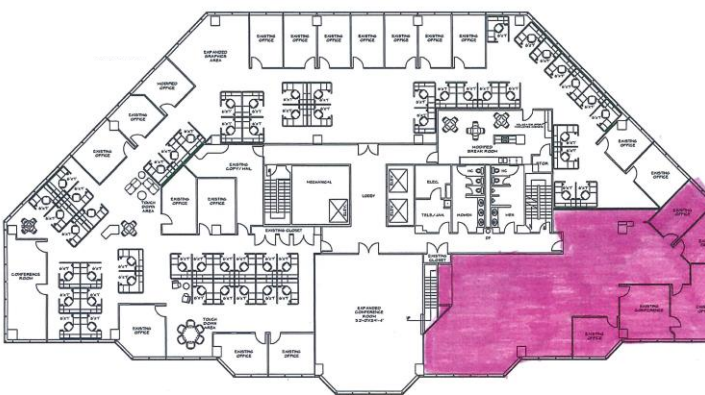
Suite 550 – 3,848 SF