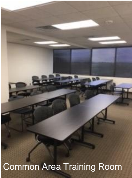
Common Area Training Room

Suite 110 – 9,392 rsf – Divisible Suite 105 – 3,632 rsf