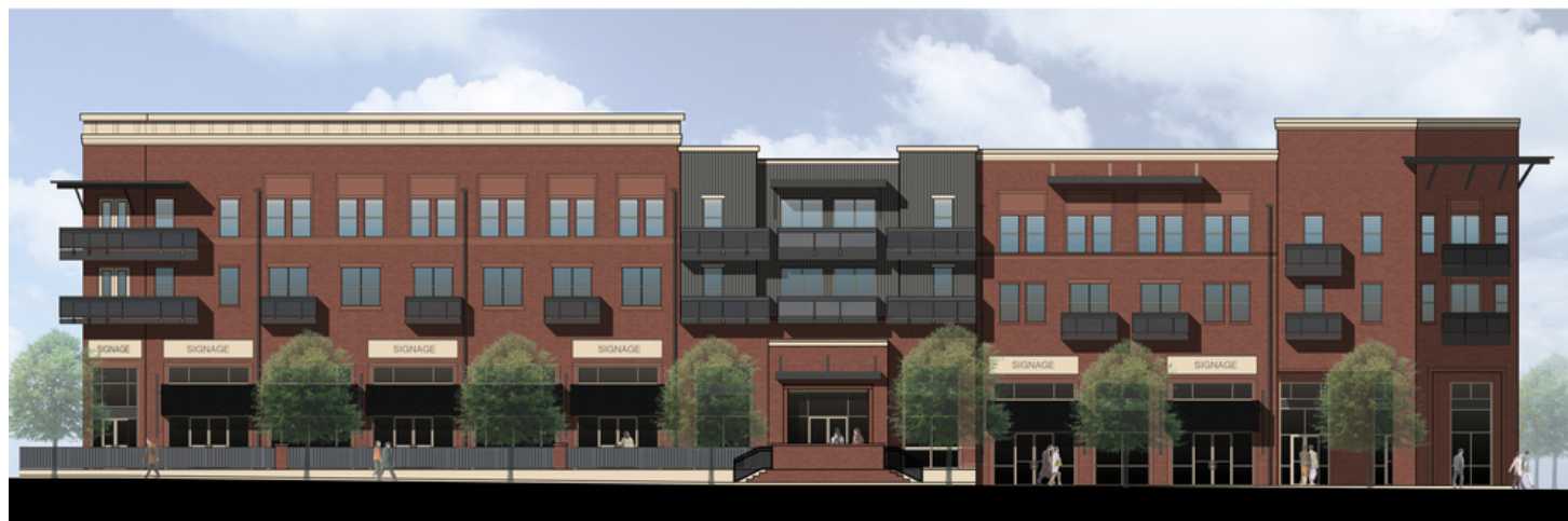
ELEVATION - SHERIDAN AVENUE