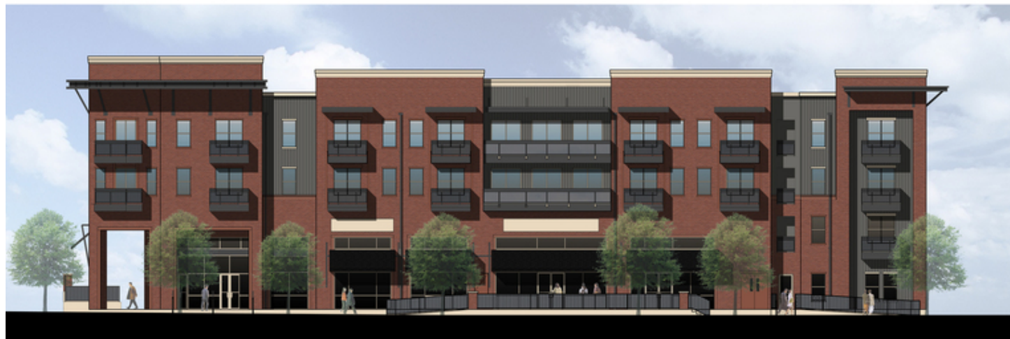
ELEVATION - SHERIDAN AVENUE