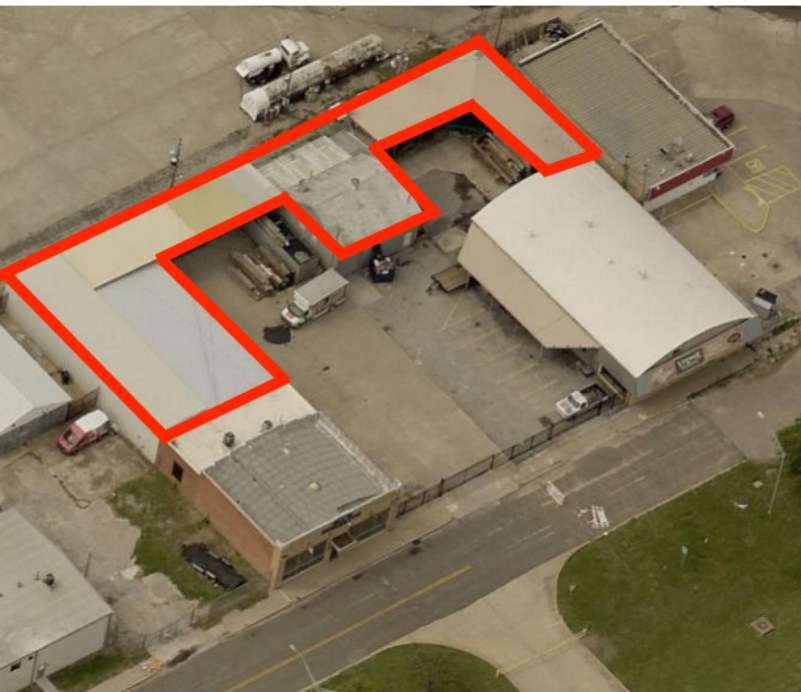
7,000+ SF of covered yard not included in rate