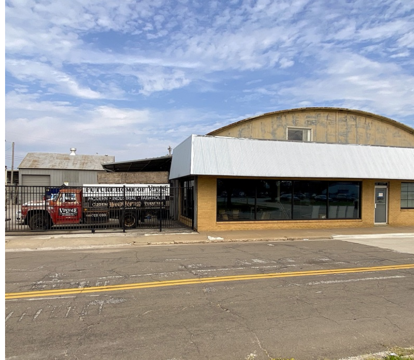
Building - 1117 Exchange & fenced yard - 4,000 SF - $12 - $14 psf NNN