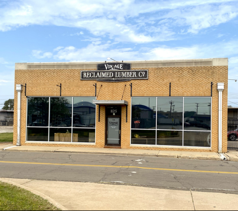
Building - 1125 Exchange - 3,000 SF - $12 - $14 psf NNN - can be combined with 1117 for a total of 7,000 SF