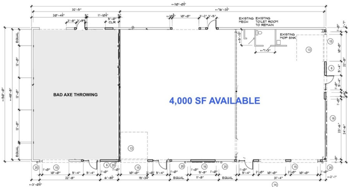
A NEW WORK FLOOR PLAN A2 SCALE: 1/8" = 1'-0"