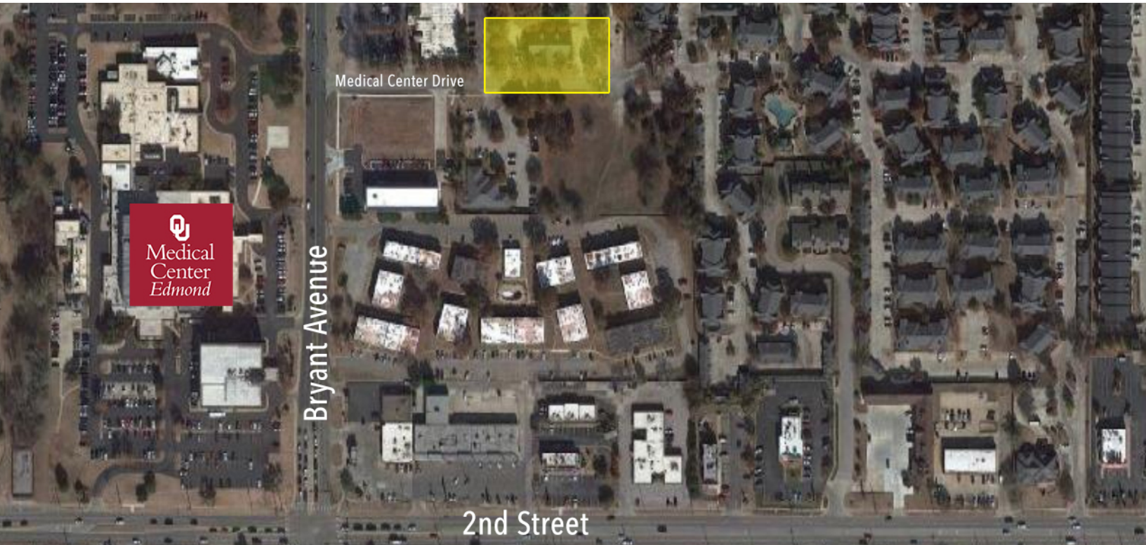
Suite 12 +/- 1,100 RSF $1,200 / month

TOM FIELDS 405.239.1205 tfields@priceedwards.com priceedwards.com