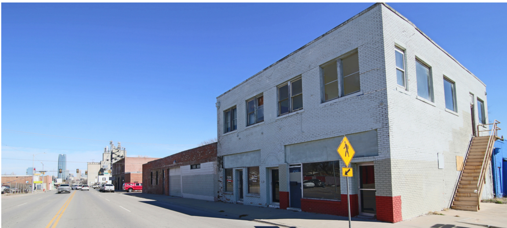
The downtown skyline is visible in the background

ROSHA WOOD 405.239.1219 rwood@pricedwards.com pricedwards.com