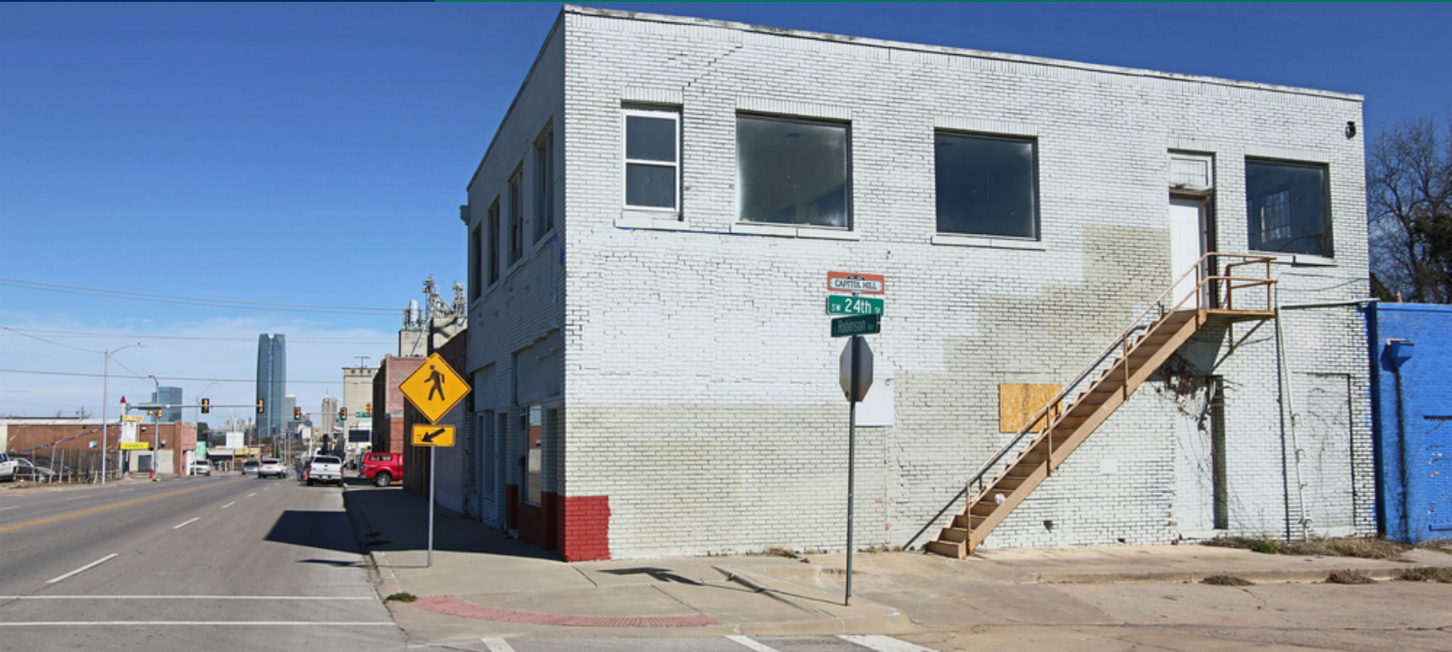
Located at the N/E corner of Robinson Ave & SW 24th

2420 S Robinson Ave, Oklahoma City, OK 73109