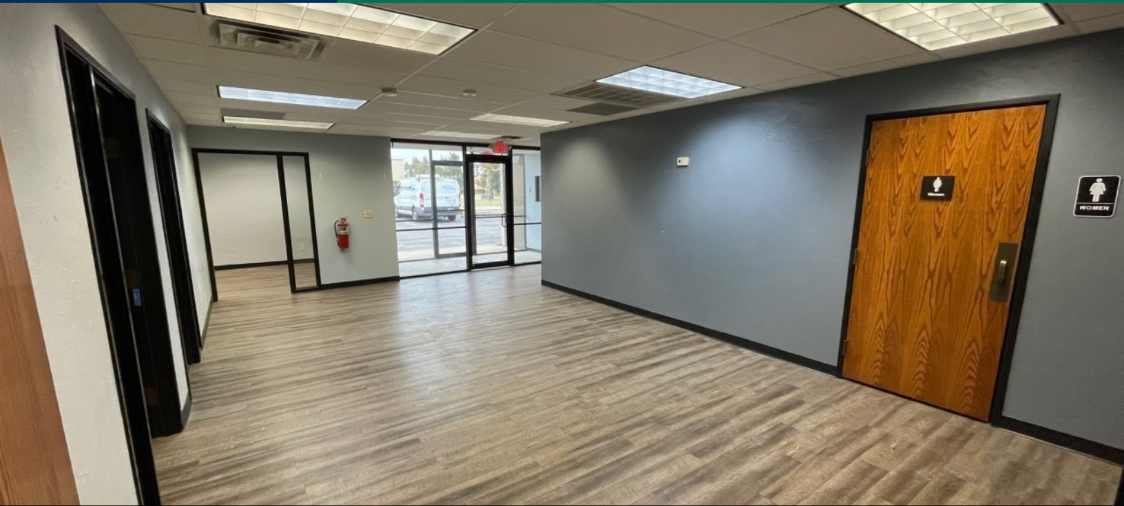
Interior photograph of the suite

4300 Charter Avenue, Oklahoma City, OK 73108