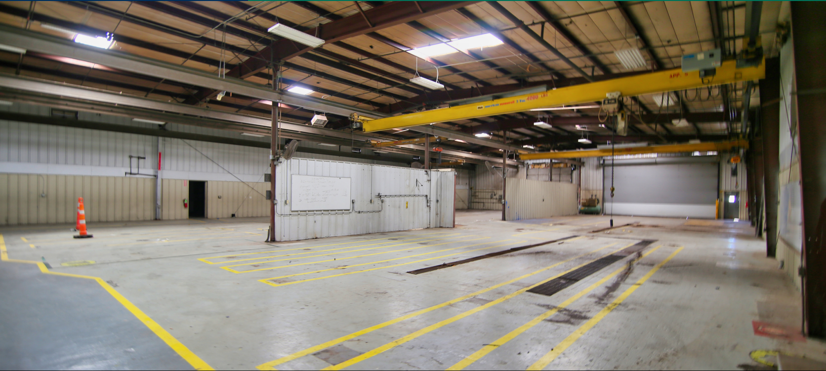
Interior of Warehouse

6209 S Sooner Road, Oklahoma City, OK 73135