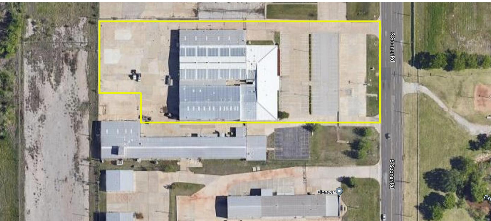
Aerial of 6209 S Sooner Road

CODY BEAT 405.239.1235 cbeat@priceedwards.com priceedwards.com