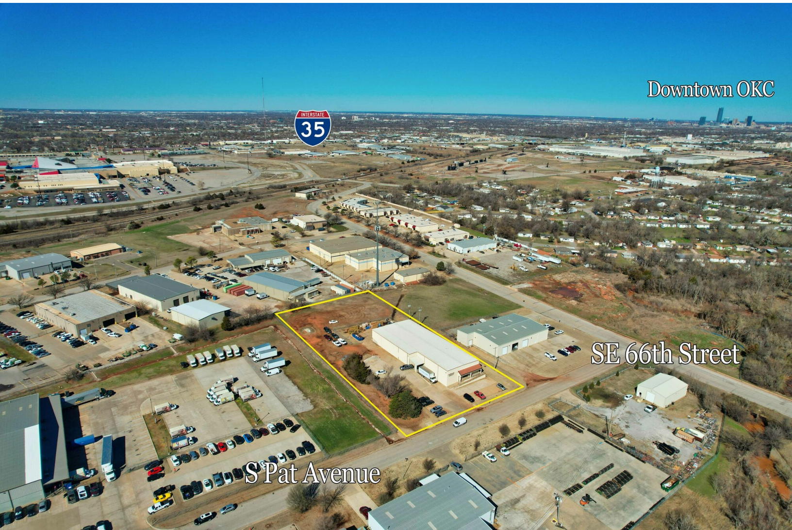
Aerial of the property

6725 Pat Avenue, Oklahoma City, OK 73149