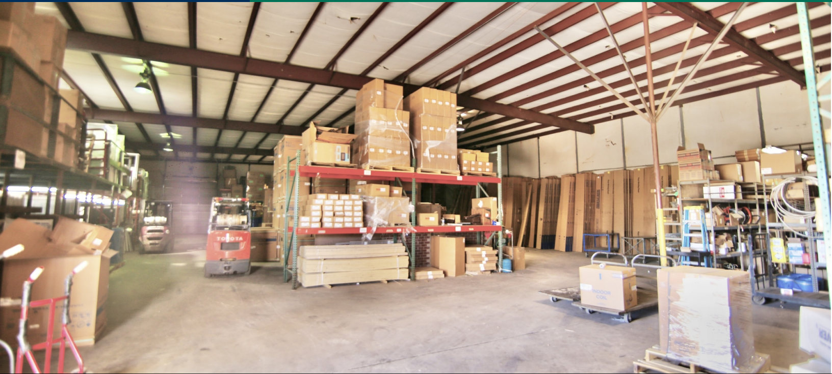
Interior of warehouse

6725 Pat Avenue, Oklahoma City, OK 73149