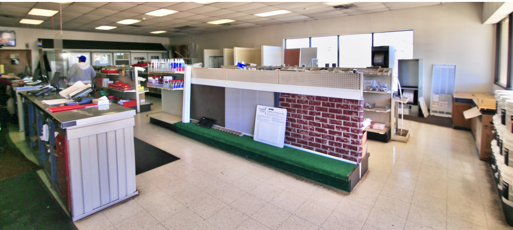
Interior of showroom

CODY BEAT 405.239.1235 cbeat@priceedwards.com priceedwards.com