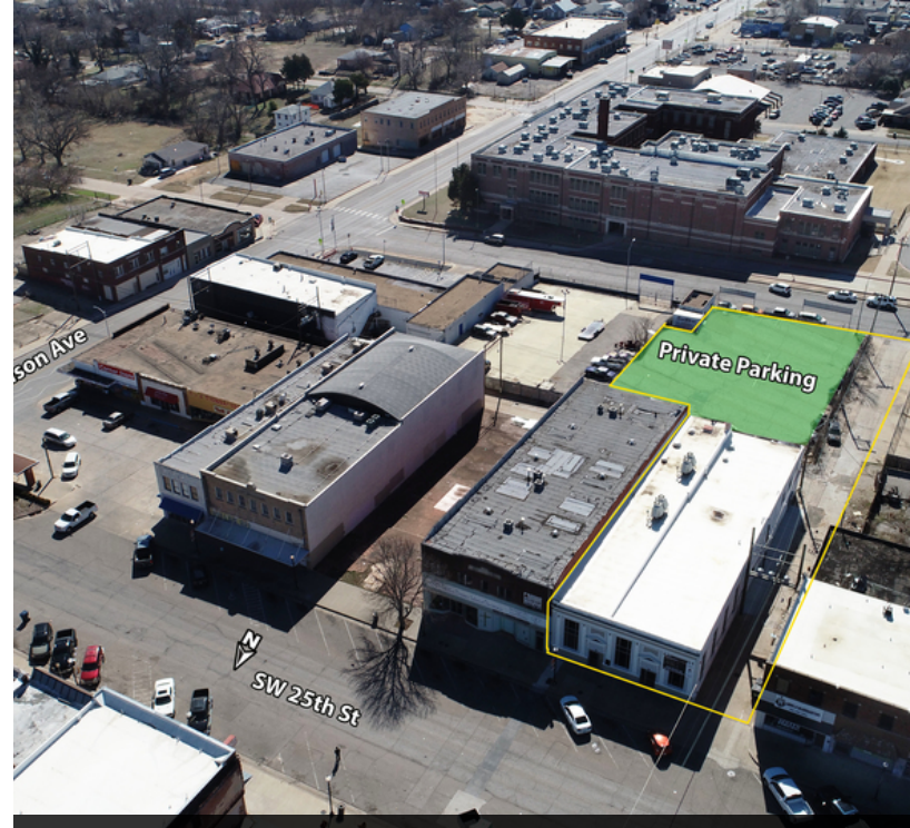
0.32 Acres | Private Parking available

Imagine the possibilities in Capitol Hill District