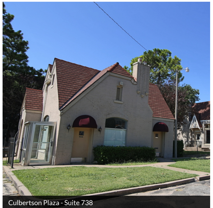
Culbertson Plaza - Suite 738