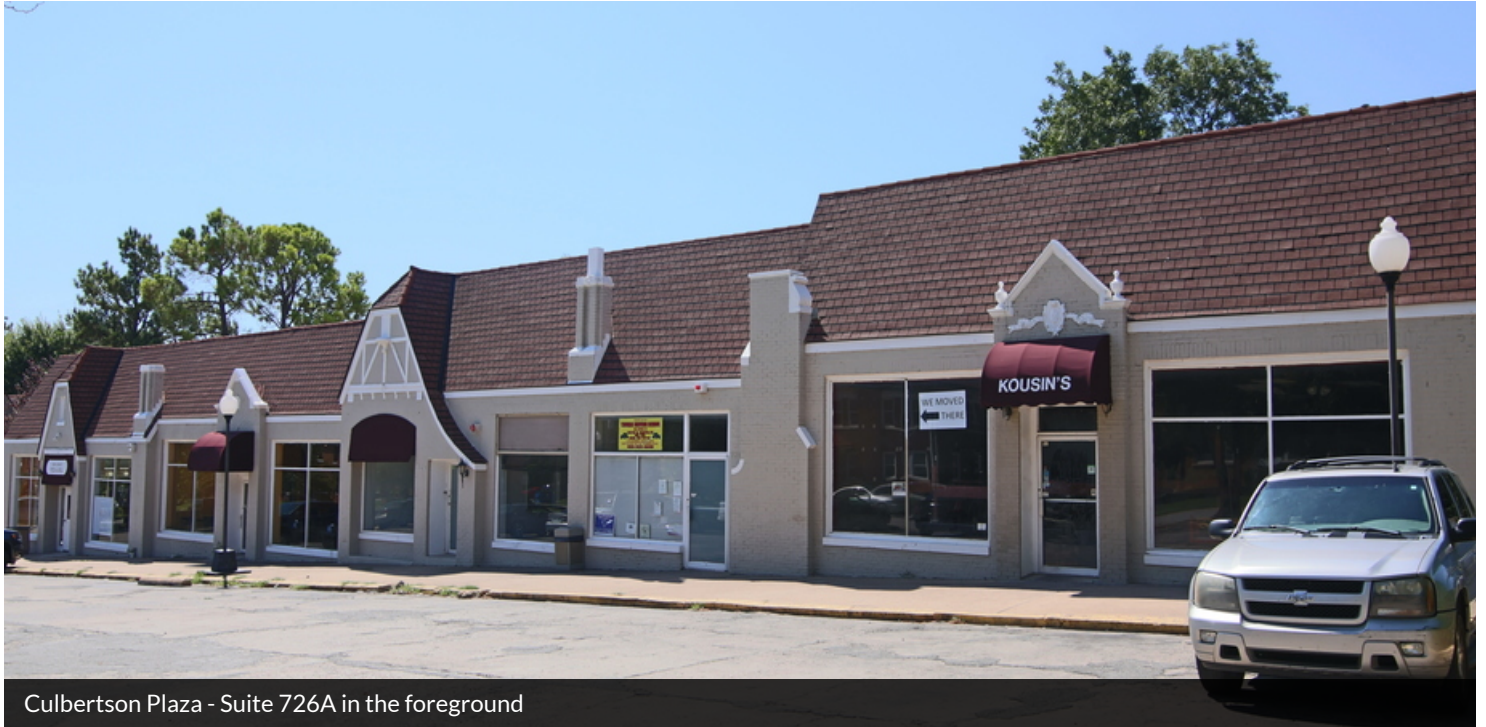
Culbertson Plaza - Suite 726A in the foreground