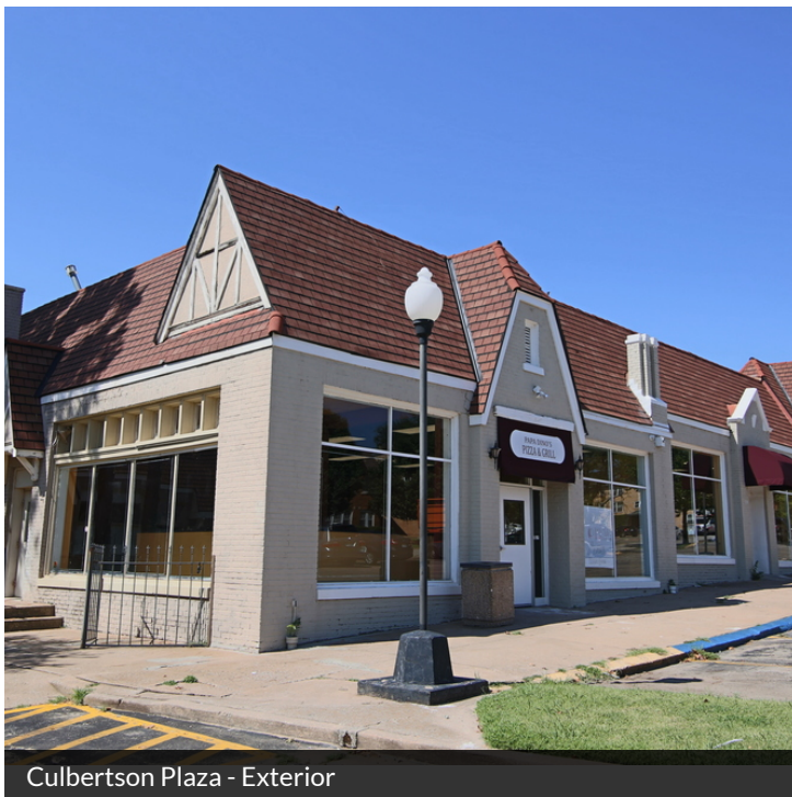
Culbertson Plaza - Exterior