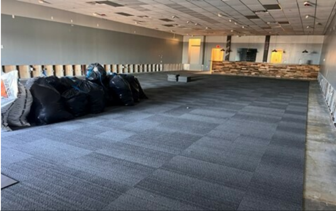
Suite B - Interior photo