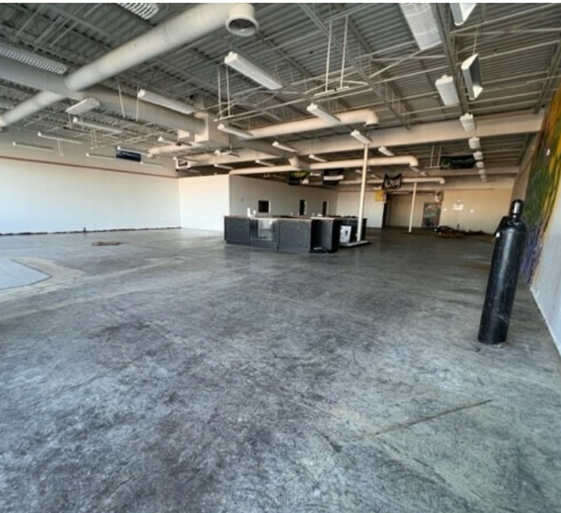
Suite C - Interior photo