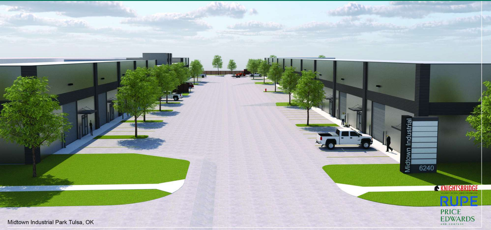
Midtown Industrial Park Tulsa, OK