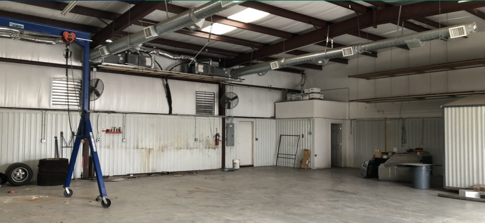
2814 W Reno, OKC | Industrial space for lease - interior photo