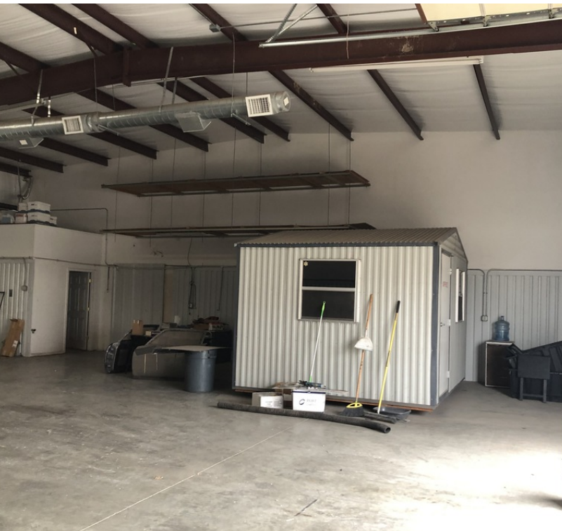
2814 W Reno, OKC | Industrial space for lease - interior photo