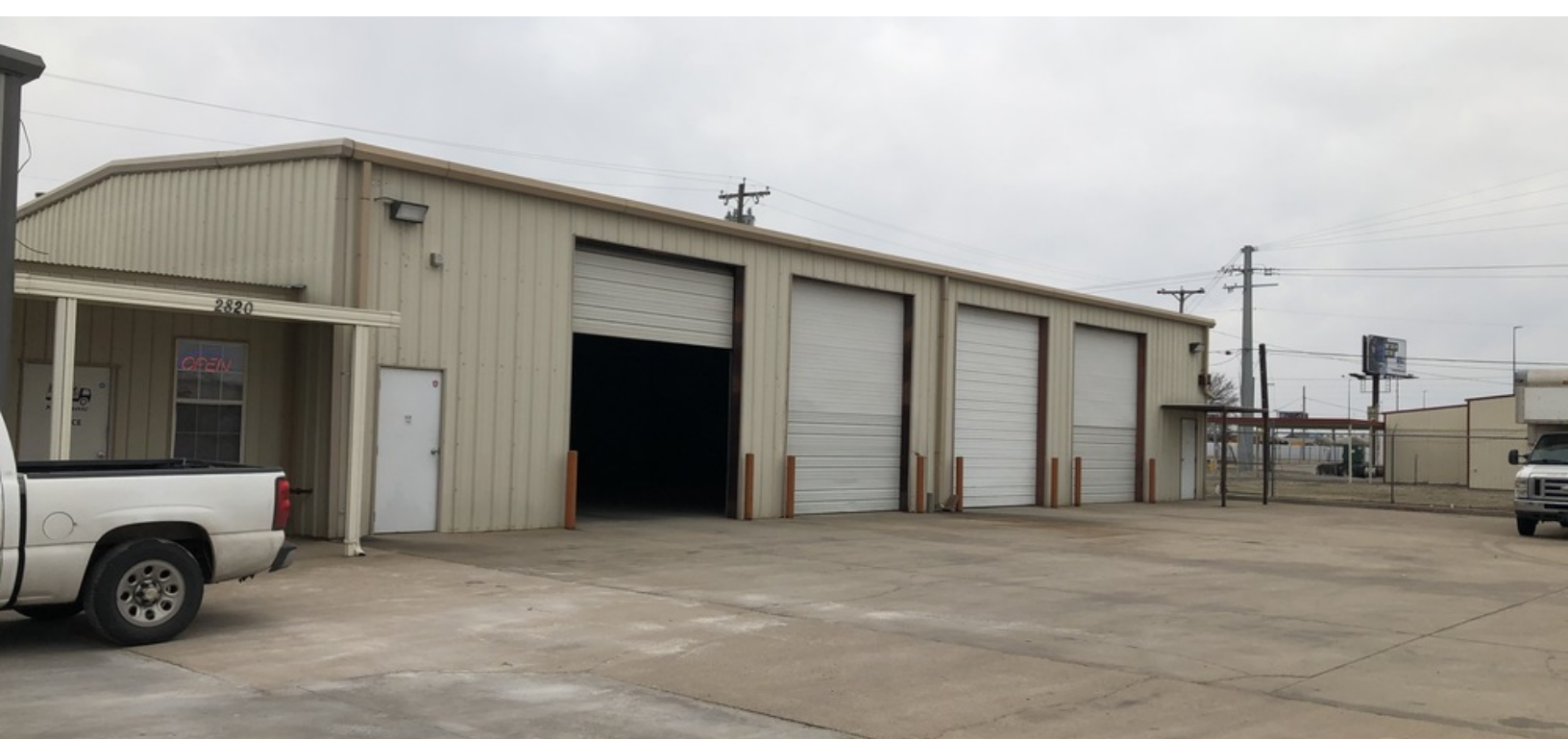
2830 W Reno, OKC | Industrial space for lease - exterior photo

EV ERNST 405.843.7474 ernst@priceedwards.com