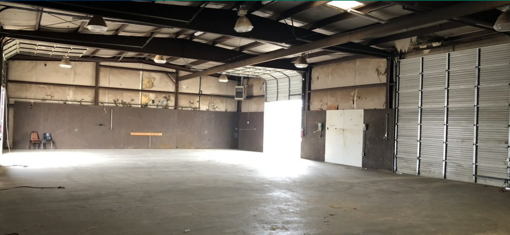
2830 W Reno, OKC | Industrial space for lease - interior photo