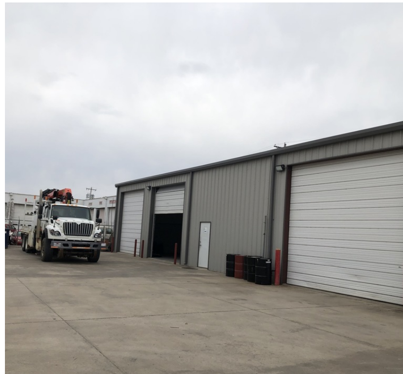
2814 W Reno, OKC | Industrial space for lease - exterior photo

EV ERNST 405.843.7474 ernst@priceedwards.com