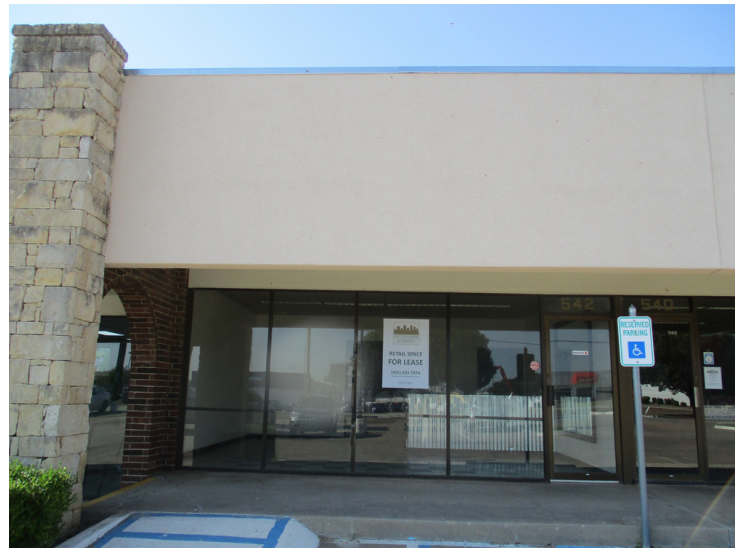
Suite 542 - 1,200 sq ft available