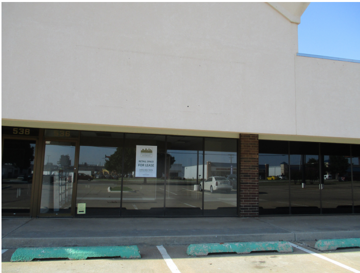
Suite 536 - 2,400 sq ft available