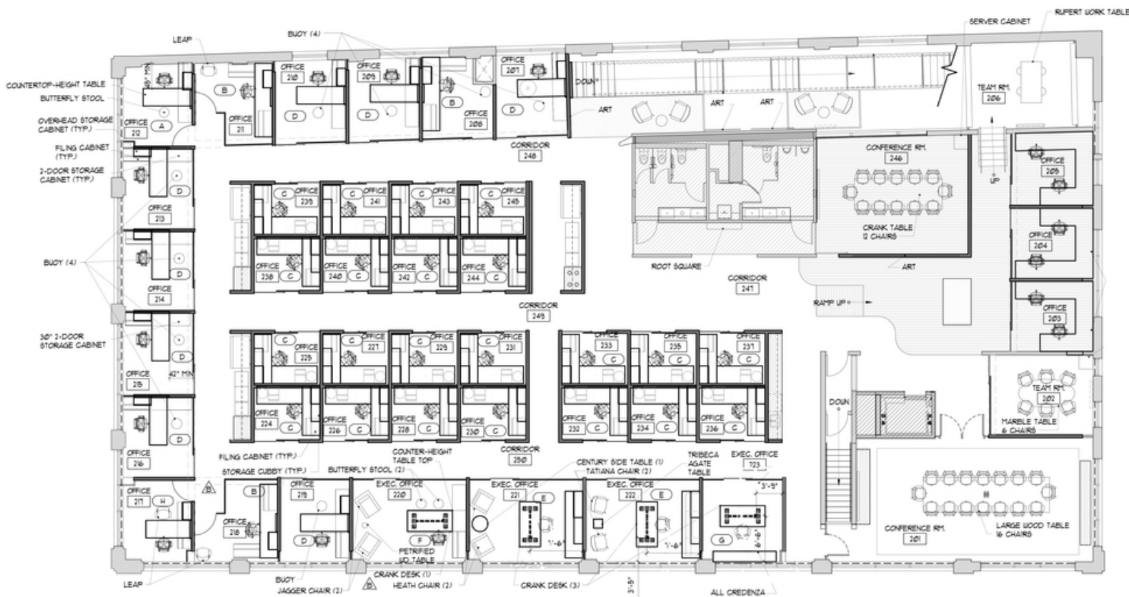
FLOOR 2 SCALE: 1/8" = 1'-0"

C. DEREK JAMES 405.239.1206 djames@pricedwards.com pricedwards.com