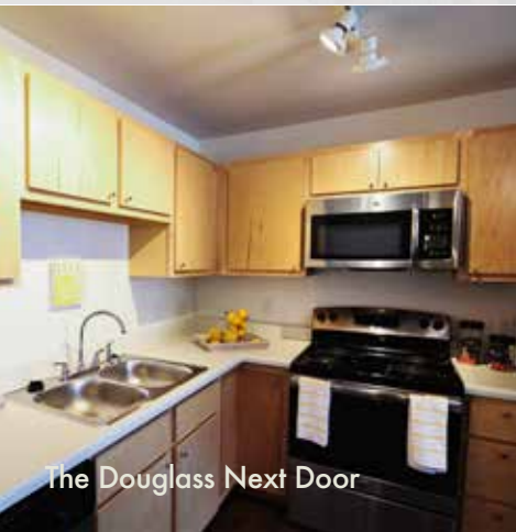
The Douglass Next Door