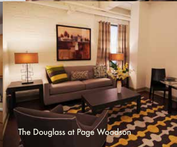
The Douglass at Page Woodson

The Douglass at Page Woodson combines history and innovation in every apartment. Enjoy the natural light and city views from your new studio, 1, or 2 bedroom home!