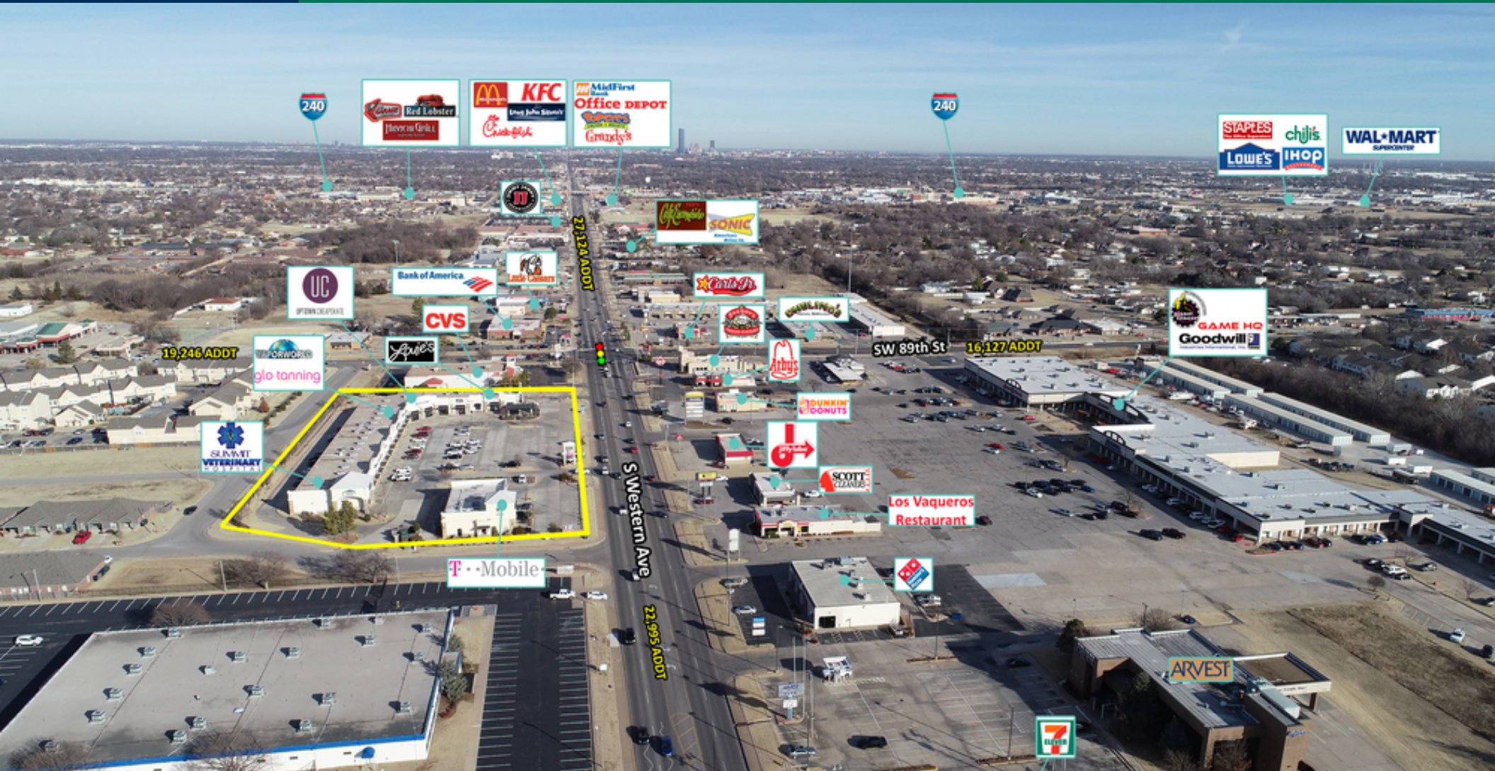
Located on a Prime corner in one of the highest income per capita areas in Oklahoma City | The Plaza boasts national and regional tenants, such as T-Mobile and Louie's Bar & Grill