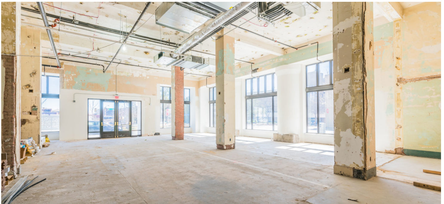
East Retail Space