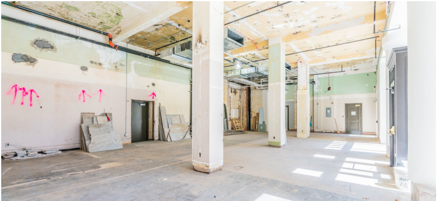
West Retail Space