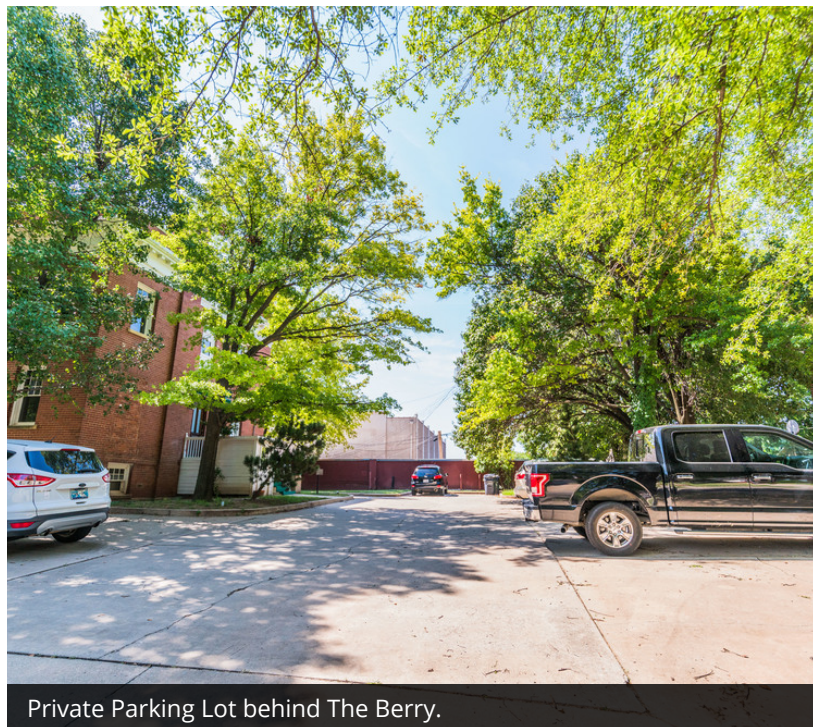
Private Parking Lot behind The Berry.