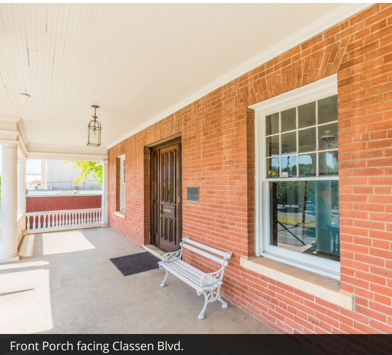
Front Porch facing Classen Blvd.