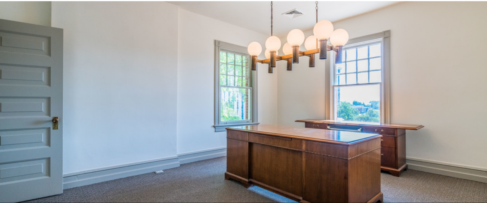
Executive Office with bird's-eye view of Downtown Oklahoma City.

1923 N Classen Blvd, Oklahoma City, OK 73106