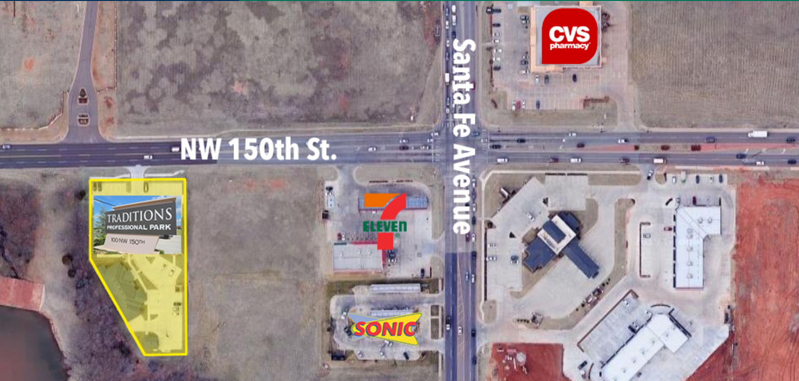
Suite C-2 512 RSF