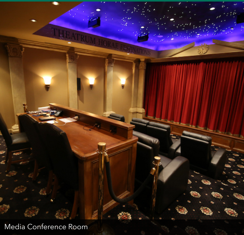
Media Conference Room

2940 NW 149TH STREET OKLAHOMA CITY, OK 73120