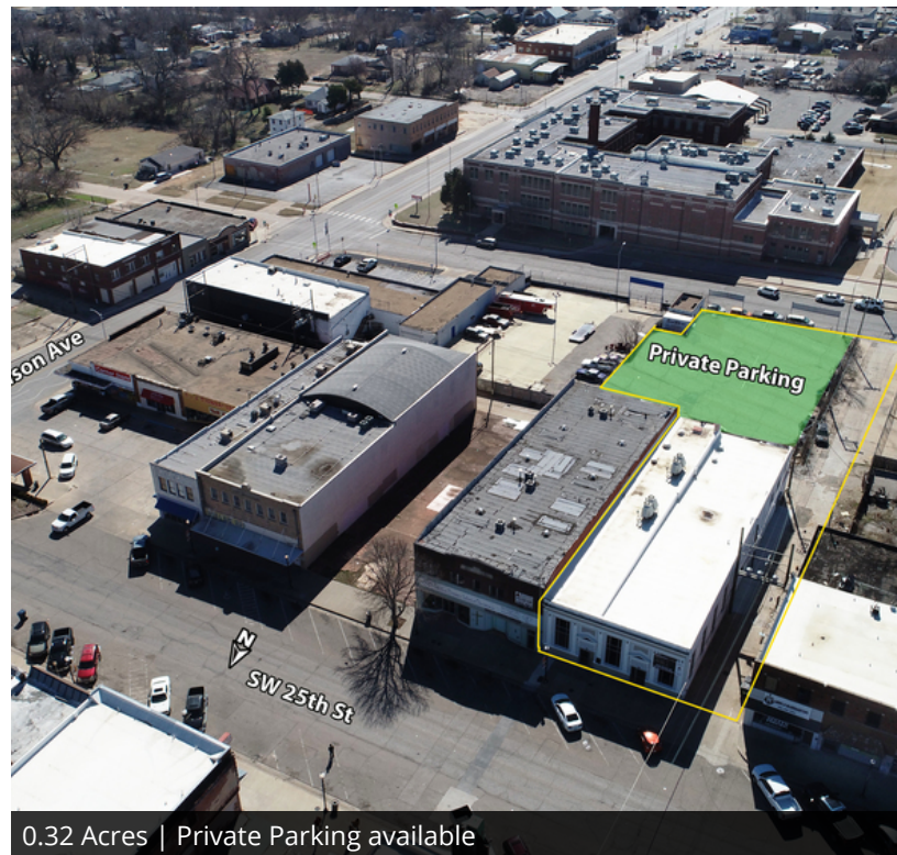
0.32 Acres | Private Parking available

ROSHA WOOD 405.239.1219 rwood@priceedwards.com priceedwards.com