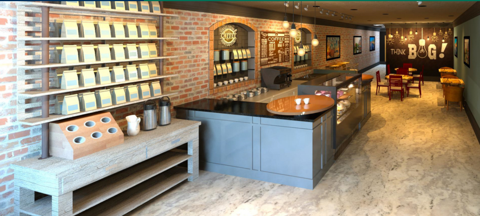
Imagine the endless opportunities for Office | Restaurant/Bar Concept | Showroom

226-228 SW 25th Street, Oklahoma City, OK 73109