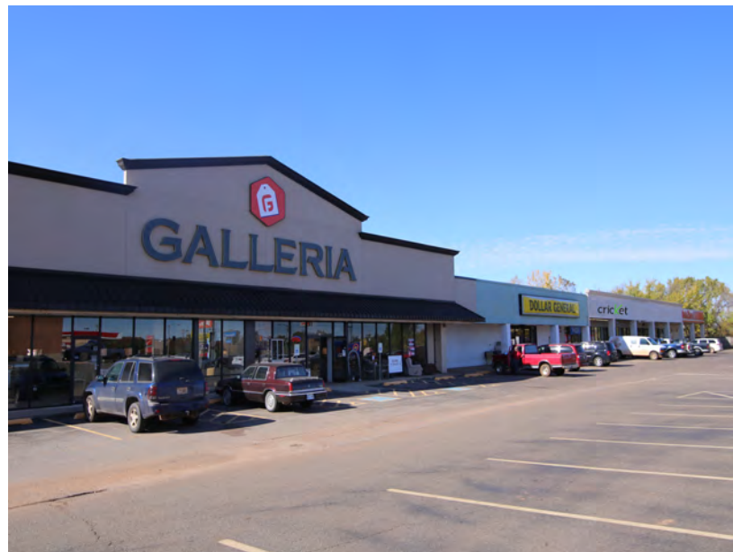
Galleria and Walgreens are separately Owned

ROSHA WOOD 405.239.1219 rwood@priceedwards.com priceedwards.com