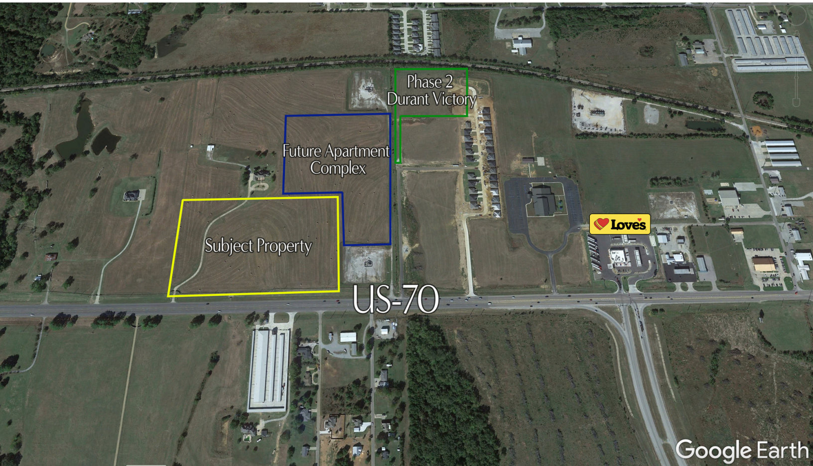
Aerial photograph of surrounding multifamily and single family developments

CODY BEAT 405.239.1235 cbeat@pricedwards.com pricedwards.com