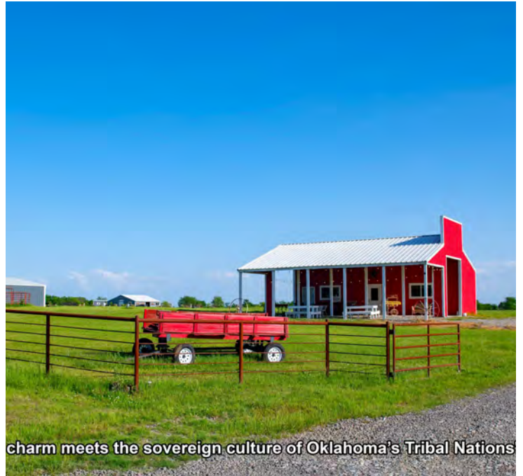
charm meets the sovereign culture of Oklahoma's Tribal Nations