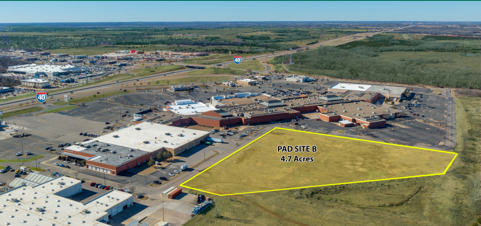
PAD SITE B 4.7 Acres