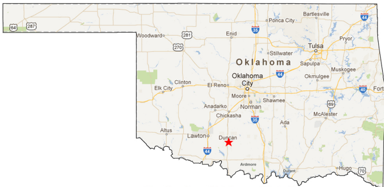
81 miles from Oklahoma City to Duncan