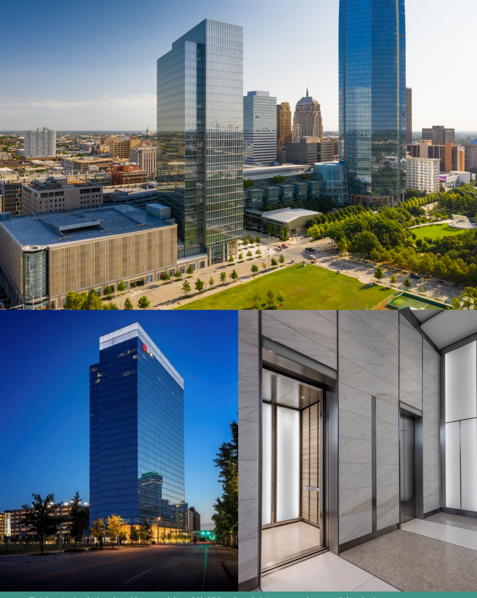
The information above has been obtained from sources believe reliable. While we do not doubt its accuracy, we have not verified it and make no guarantee, warranty, or representation about it. You and your legal and technical advisors should conduct a careful, independent investigation of the property to determine to your satisfaction to the suitability of the property for your needs.