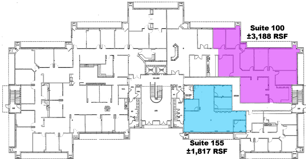
1ST FLOOR - OVERALL PLAN ASB SCALE 1/4" = 1'-0"